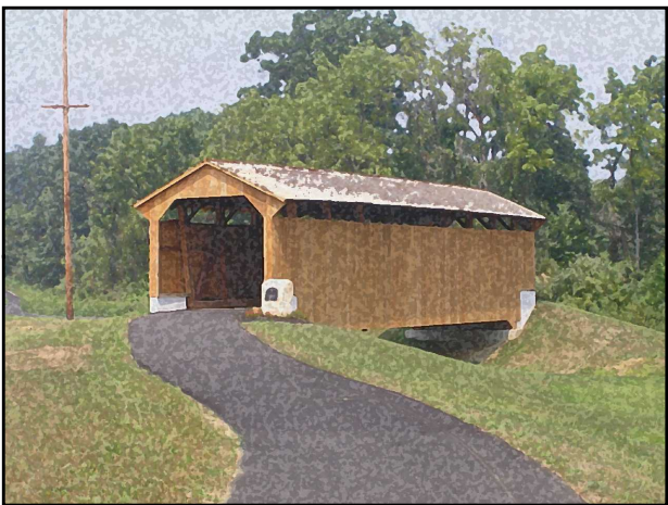
Larkin's Bridge, Byers Station