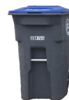
Recycling 96 Gallon Toter Blue Lid

Place Toters at the curb the night before your collection day, and at least 3 feet apart and away from mailboxes, cars and other obstacles.