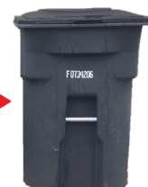
Trash 96 Gallon Toter Black Lid